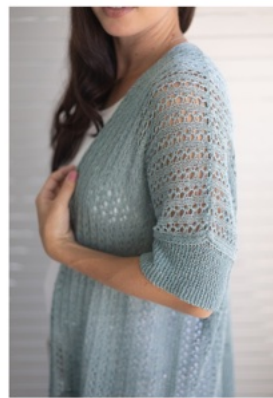
RINCON CAFTAN cardigans