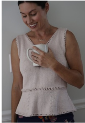
SISTER PEPLUM tops