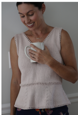
SISTER PEPLUM tops